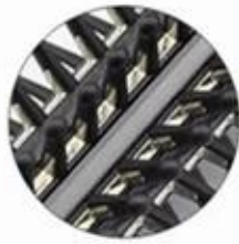
Optional 2: All metal teeth