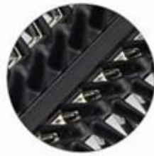
Optional 3: Half plastic teeth & half metal teeth