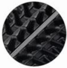
Optional 1: All plastic teeth