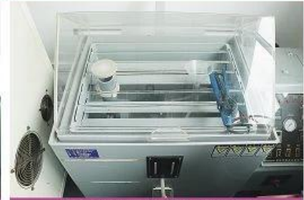
Salted steam testing machine