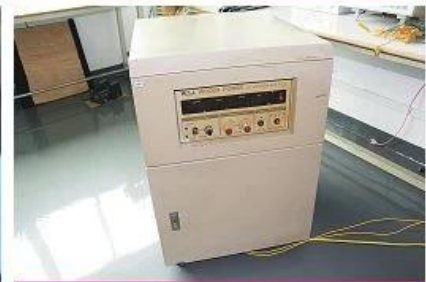
AC power source 2