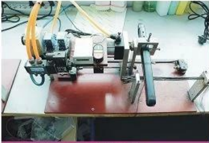
Life test machine