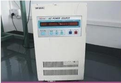
AC power source 1