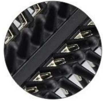
Optional 3: Half plastic teeth & half metal teeth