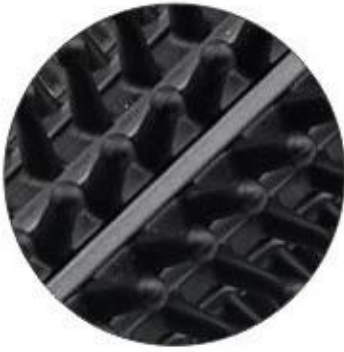
Optional 1: All plastic teeth