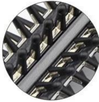
Optional 2: All metal teeth