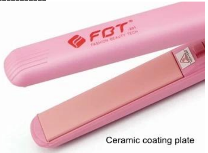
Ceramic coating plate