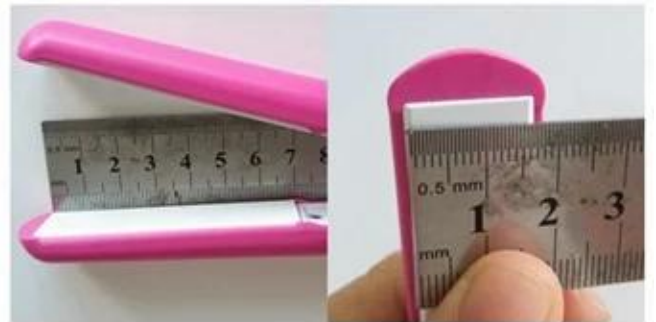
Plate size: 70mm x 17mm