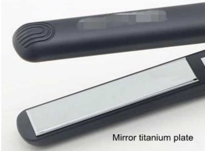
Mirror titanium plate