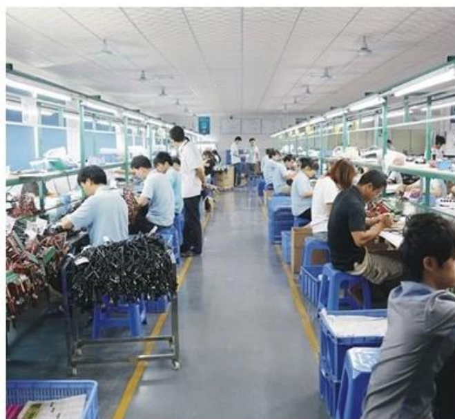
ASSEMBLY LINE 1