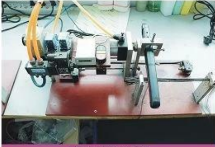
Life test machine