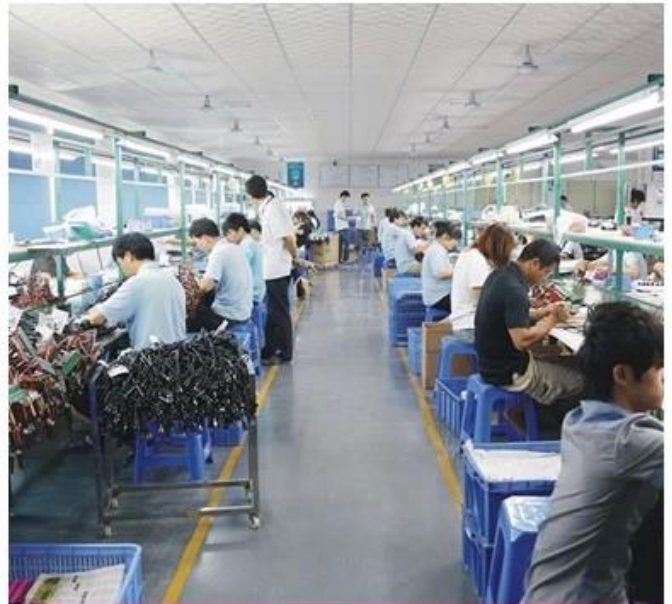
ASSEMBLY LINE 1