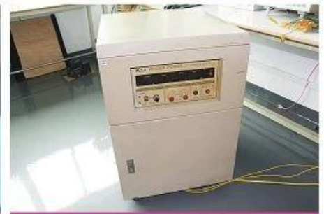
AC power source 2