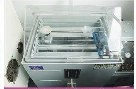
Salted steam testing machine