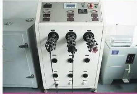
Power cord flexing test system