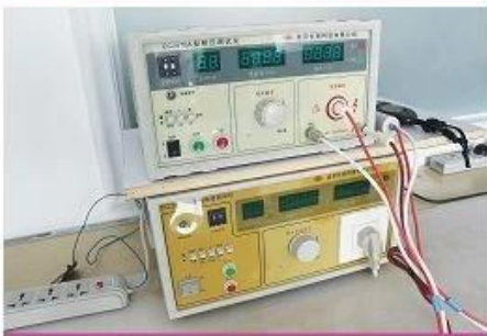
Voltage withstand tester