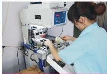
LOGO printing machine 2