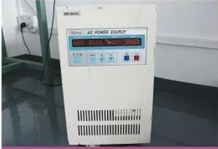
AC power source 1