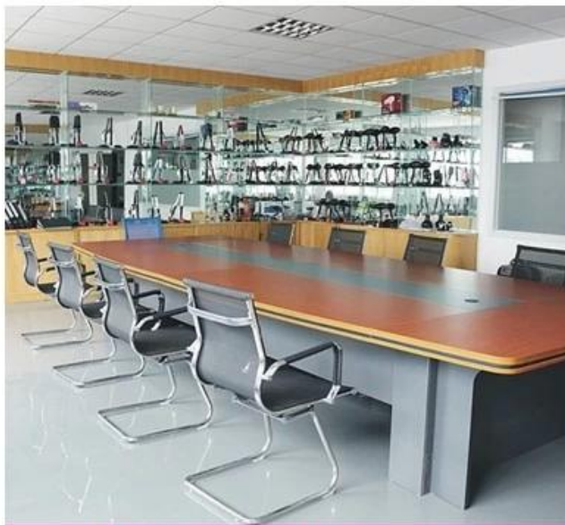
Meeting and show room