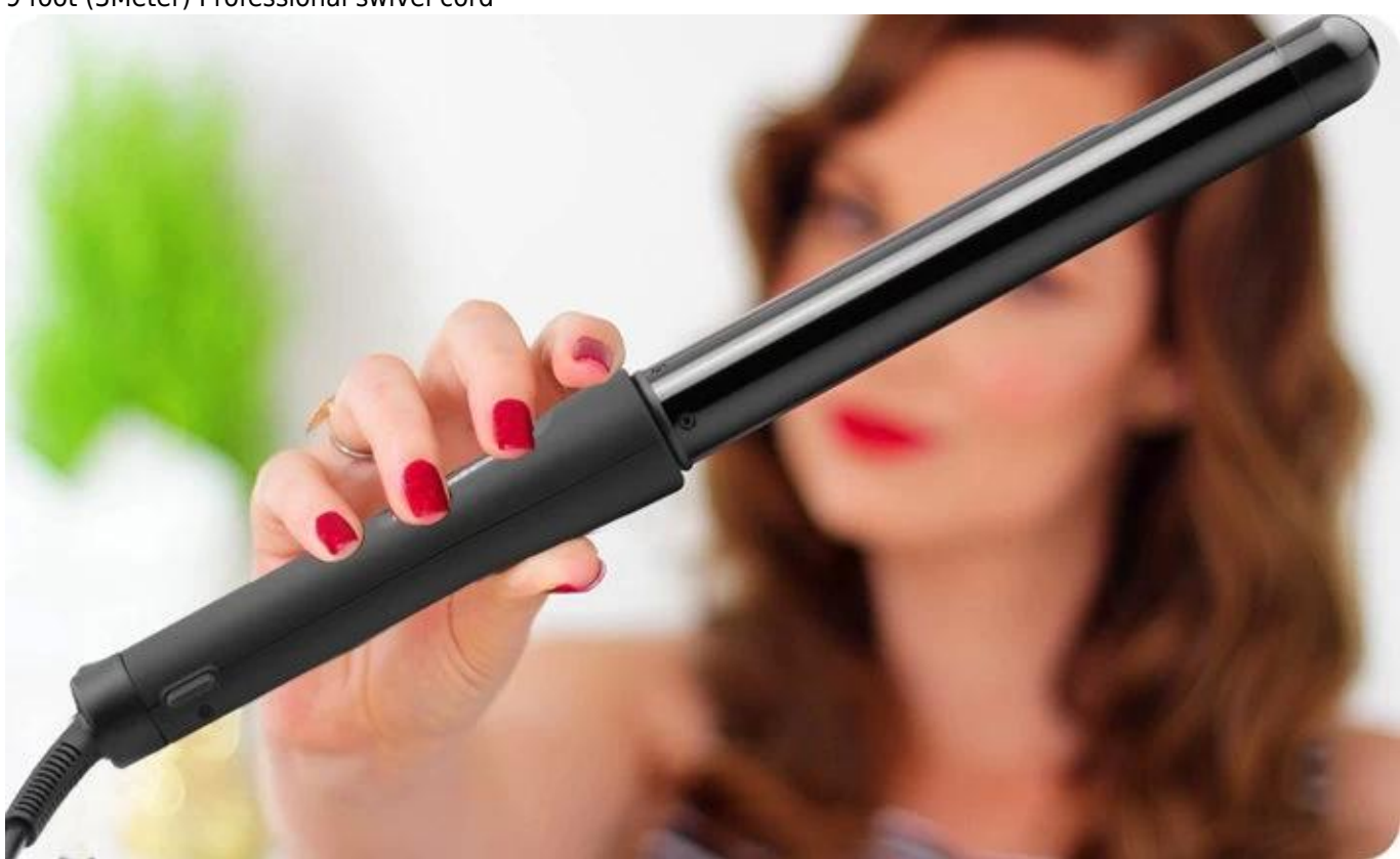
9 foot (3Meter) Professional swivel cord