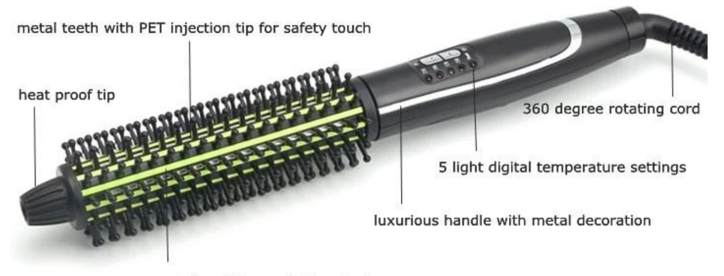
ceramic barrel for sustaining heat