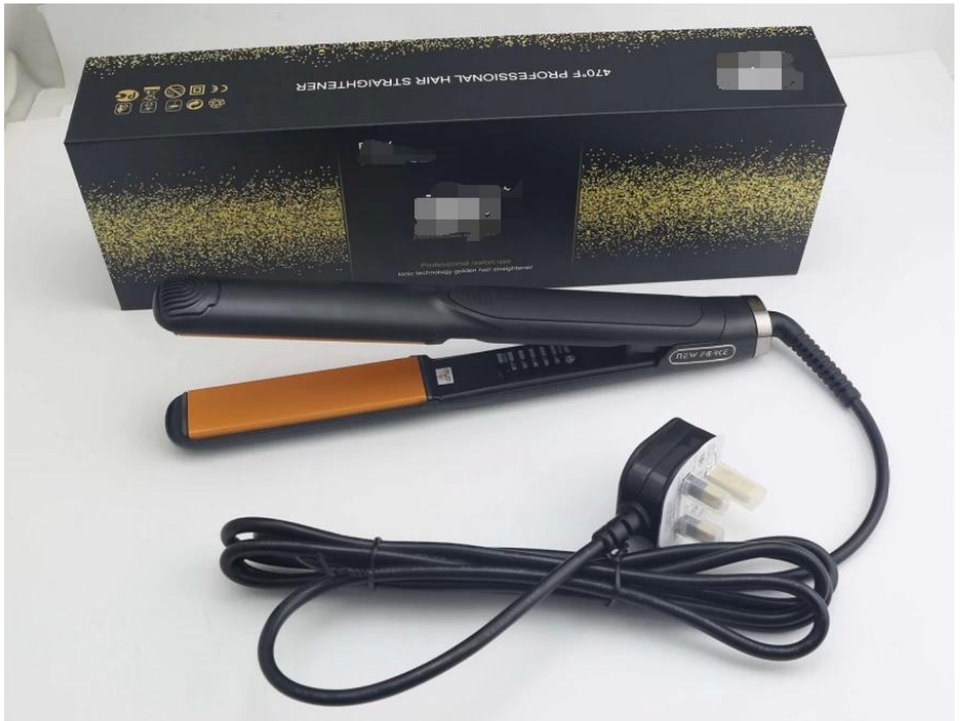
Plate size : 28mm x 105mm Weight : 380g Foldable: No

Logo: Customized Wire label: Customized Technical Label: Customized Package: Customized Main markets: Western Europe, North America, Asia, Middle East Number of factory employees:80-150