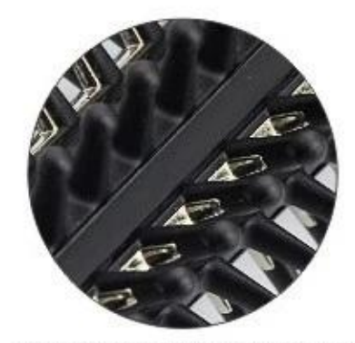
Optional 3: Half plastic teeth & half metal teeth