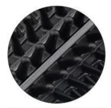
Optional 1: All plastic teeth