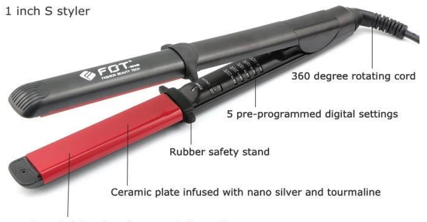
Round plate edges for more styling options

F601HB is a multifunctional flat iron, it cannot only straight your hair, but also makes curls. It is the winner of "SalonStar" in the competition in Germany in 2013.