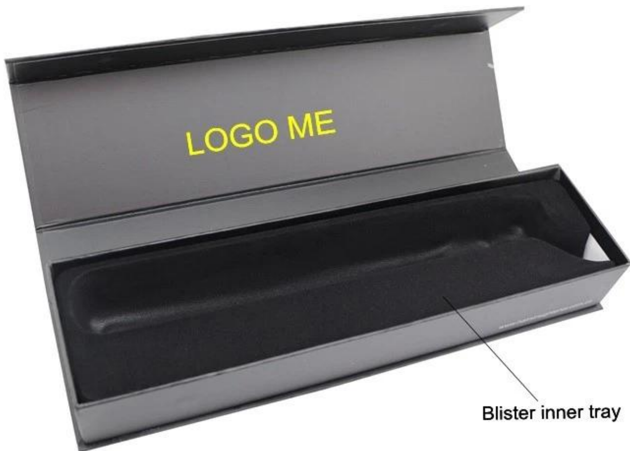
Blister inner tray