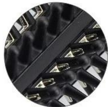
Optional 3: Half plastic teeth & half metal teeth