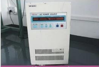
AC power source 1