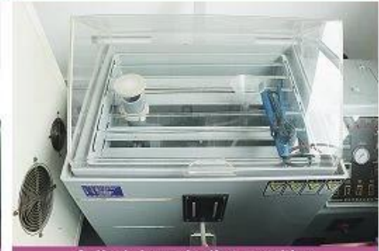
Salted steam testing machine