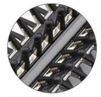
Optional 2: All metal teeth