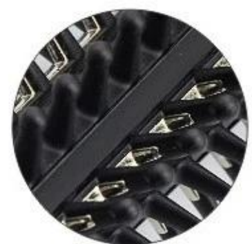
Optional 3: Half plastic teeth & half metal teeth