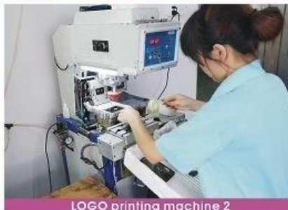
LOGO printing machine 2