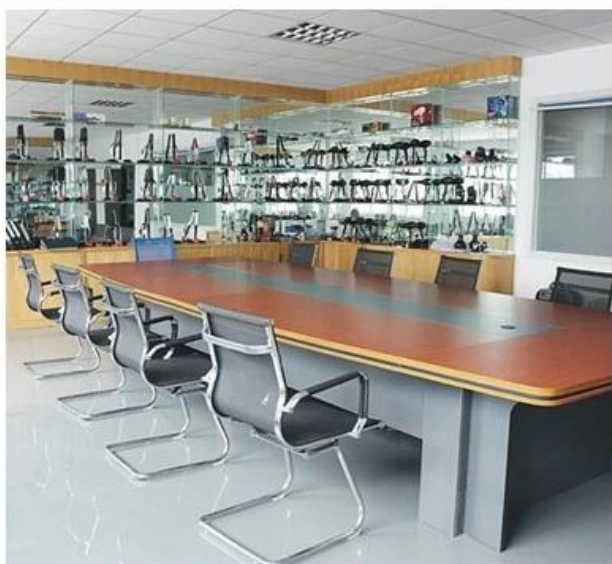
Meeting and show room