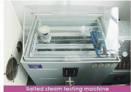
Salted steam testing machine