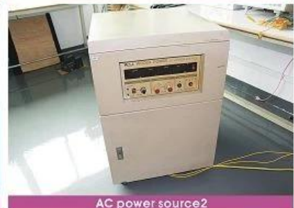
AC power source 2