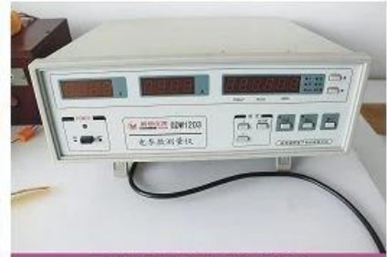
Electrical parameter tester