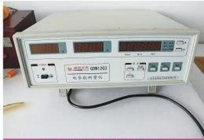
Electrical parameter tester