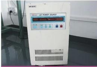
AC power source 1