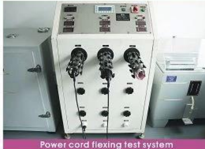
Power cord flexing test system