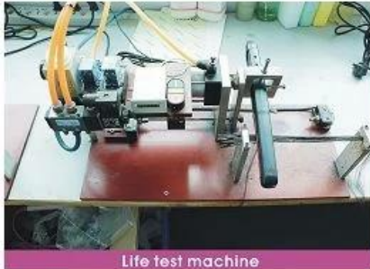
Life test machine