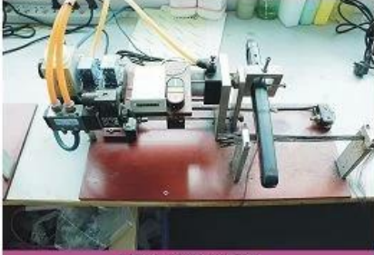
Life test machine