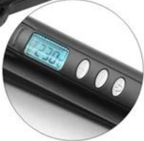
Up to 230°C(450°F) LCD DISPLAY