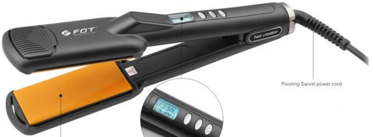
Pivoting Swivel power cord