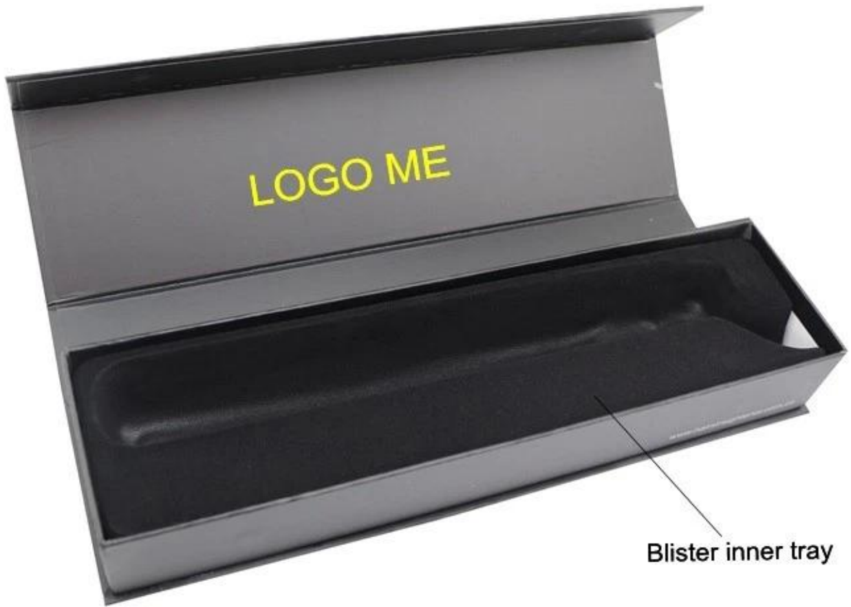
Blister inner tray